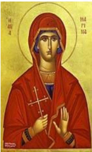
Great Martyr Marina July 17