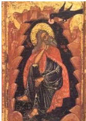
Prophet Elias July 20